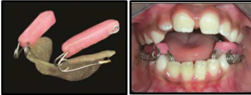
Figure 7: Spring Loaded Bite Blocks.