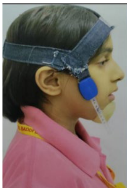
Figure 4: Vertical Pull Chin cap.