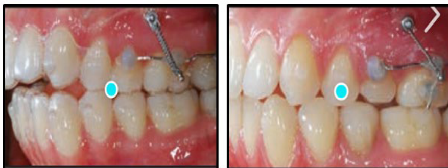
Figure 11: clear aligner showing intrusion.

Maxillary and mandibular incisor extrusion and lingual tipping of the mandibular incisor is also seen [Figure 13].