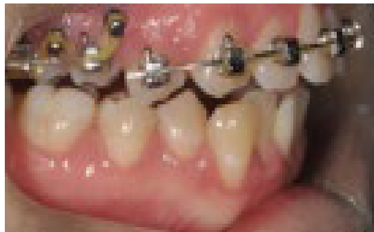
Figure 8: TADs