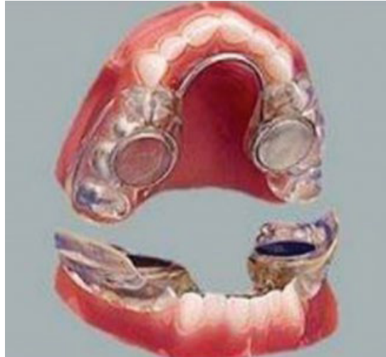
Figure 13: Active Vertical Corrector.