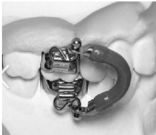
Figure 9: Rapid Molar Intrusion Device.