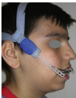
Figure 3: High Pull Headgear with a splint.