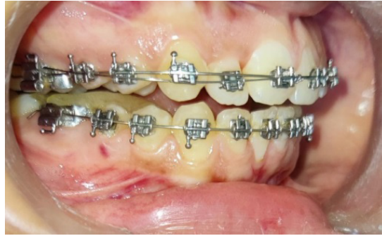
Figure 5: Posterior Bite Block.