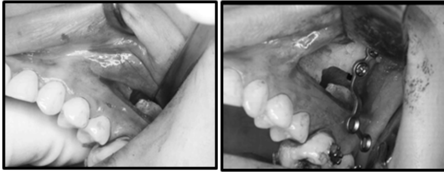
Figure 14: A miniplates was attached into the L shaped fissure formed during corticotomy.