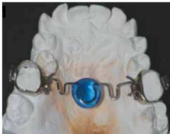
Figure 10: Vertical Holding Appliance.