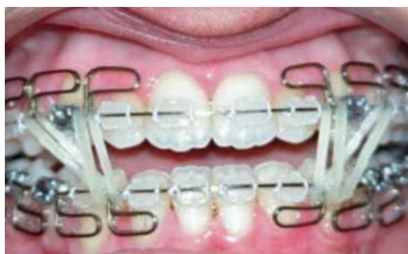
Figure 12: Multi-loop Edgewise Arch Wire Technique