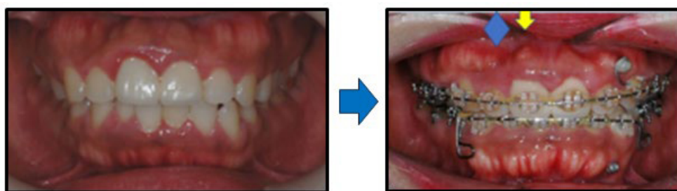
Figure 1: Esthetically compromised alveolar bone irregularity occurring due to incisor intrusion and retraction.

These appliances need patient compliance for bringing about the required changes in a specific duration of time.