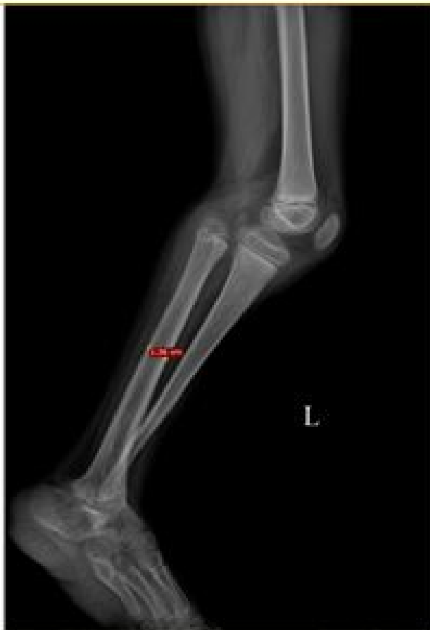
Figure 2: Pre OP Imaging (Left Side).

Limb length discrepancy – left leg shorter than right leg by 12cm. Distal tibia could not be palpated. Tarsal and metatarsal appears to be normal. Foot in varus deformity (Figure 2 and 3).