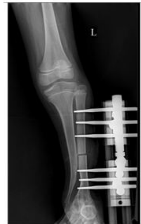
Figure 4: Surgical treatment.

According to type 4 Jones, we decided to treat the patient with fibular osteotomy under limb reconstructive system (Figures 4-8).