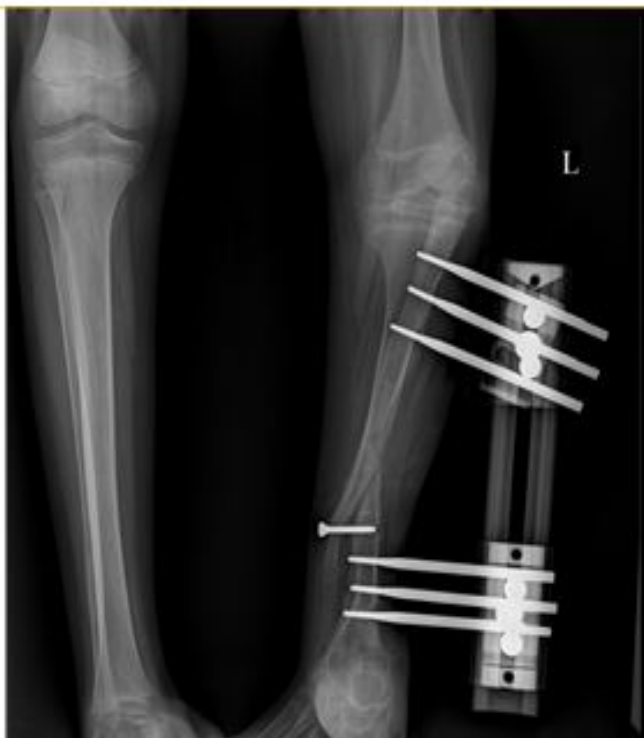
Figure 6: After 3 months: A tibiofibular synostosis was carried out using one screw.