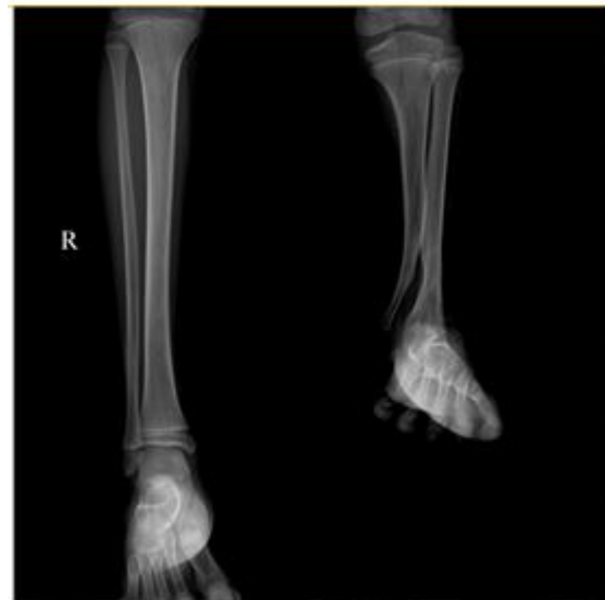
Figure 3: Pre OP Imaging (Right Side).