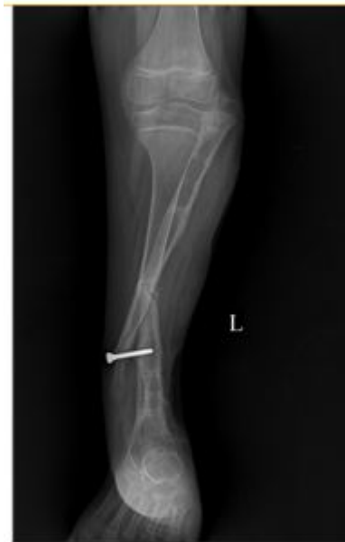
Figure 7: LRS was removed after 2 months.