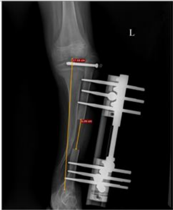
Figure 5: After 2 months: Lateral epiphysiodesis done in proximal tibia.