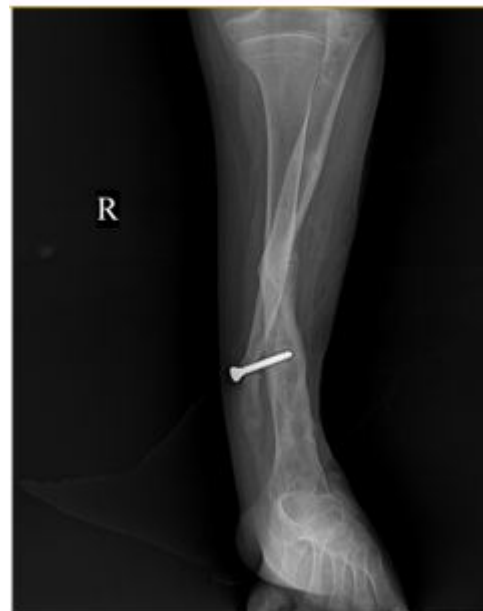
Figure 8: 2 months follow up.