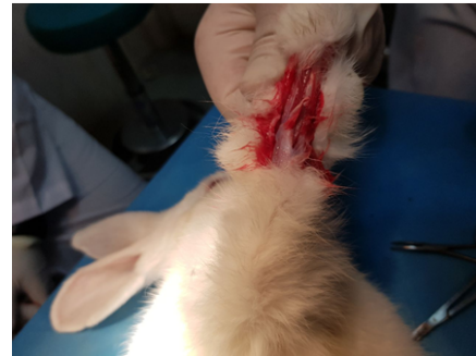
Figure 3: The synovial sheath was incised transversely between the A2 and A3 pulleys to access the flexor digitorum profundus (FDP) distal to the flexor digitorum superficialis (FDS) bifurcation

tamoxifen citrate diluted in 10 ml of aquapura, and then 2.5 mg/kg/day tamoxifen citrate was administered by orogastric gavage, postoperatively, in group 4 (control group), distilled water was used as placebo (Figure 2). Rabbits underwent exploratory incision after 21 st postoperative day (the time of the cast removal) under general anesthesia using 50 mg/kg ketamine chloride. Adhesions were examined macroscopically (Figure 3).